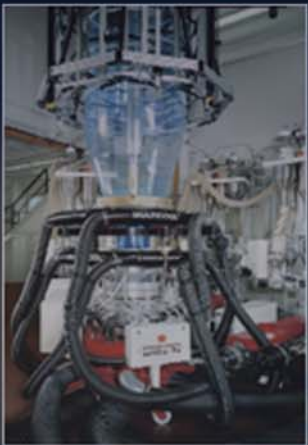
BLOW FILM MACHINE

Controlled by PLC ( Programmable Logic Controller )